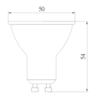
S9410 Photometric Information 3000K